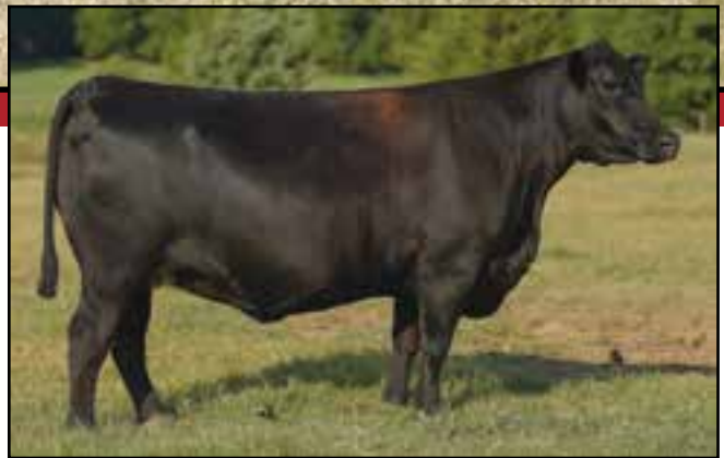
McKellar Brianna 4095 Dam of Lot 4