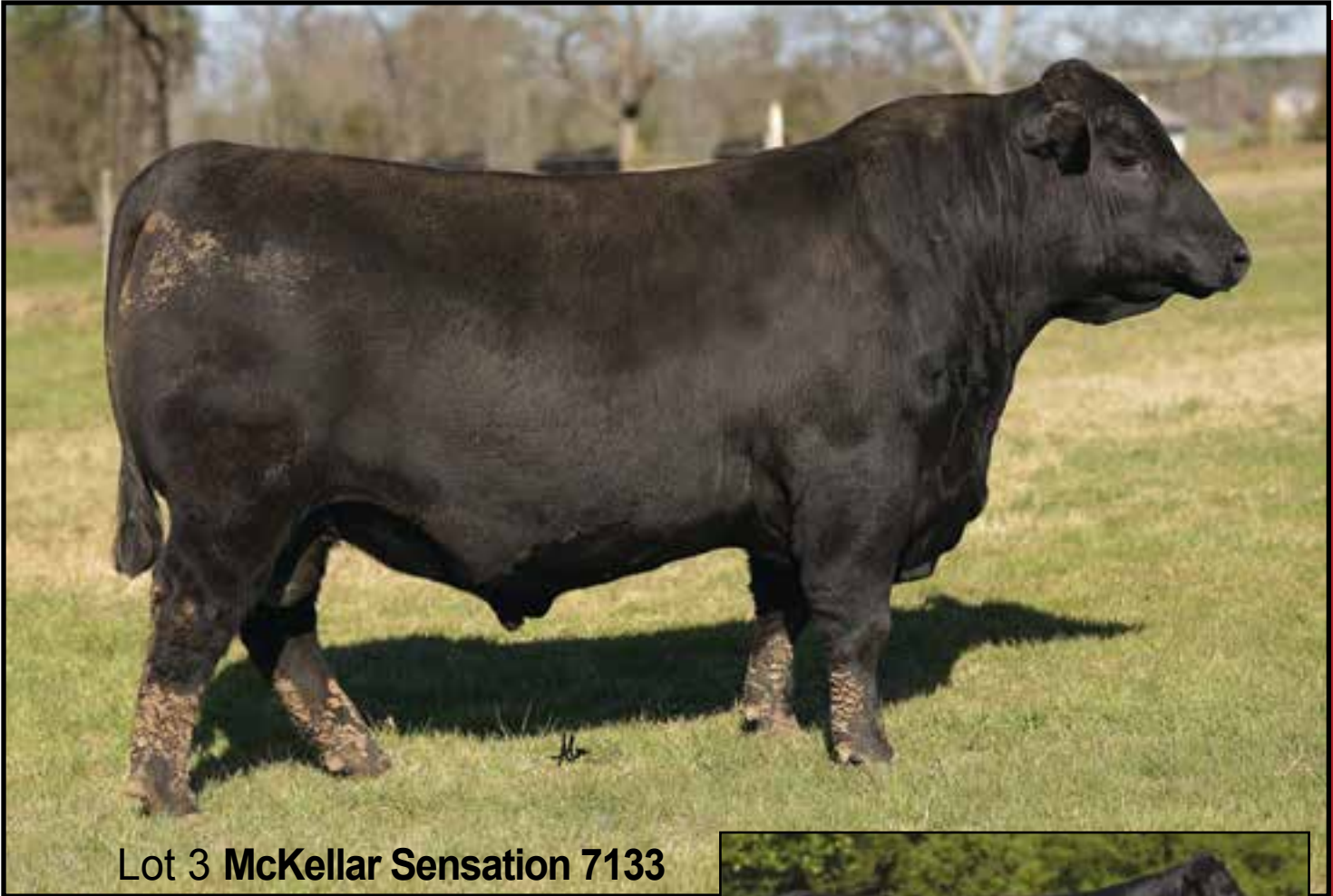
Lot 3 McKellar Sensation 7133