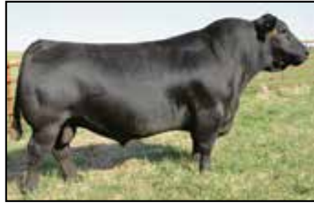
S A V Resource 10 sons sell