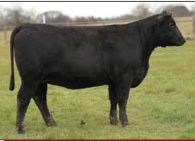
Lot 110 McKellar Bernadette May 7124