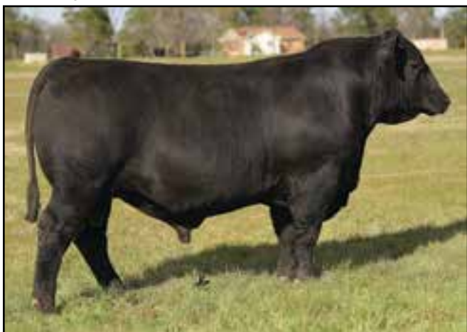
Lot 17 McKellar Renown 7244