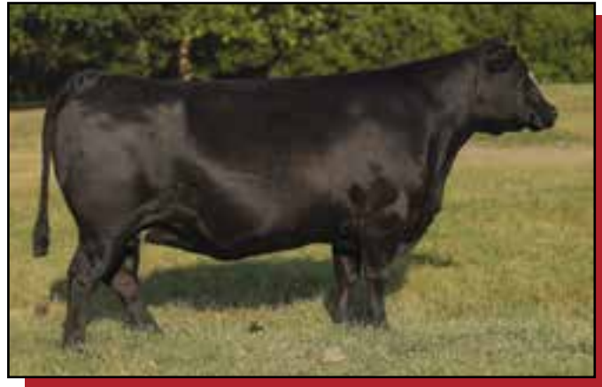
JMc Beretta 1334 W148 Reference Donor

Bred Heifer D.O.B. 12/8/17 Tattoo:7247 Reg. 19155264 ET