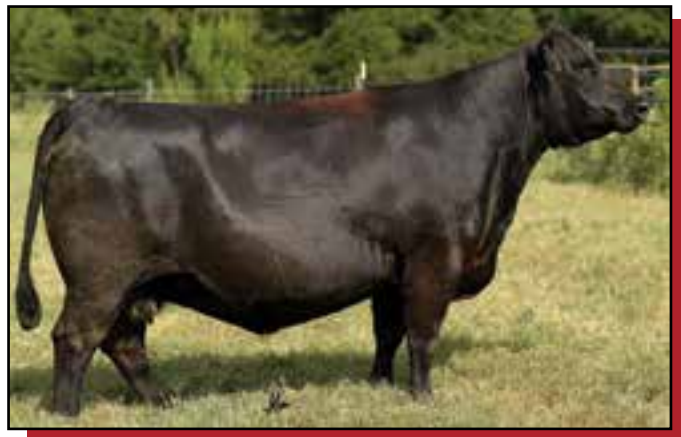
JMc Pearl's Answer 8446 6465 Reference Donor