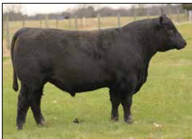
Lot 28 McKellar Renown 8058