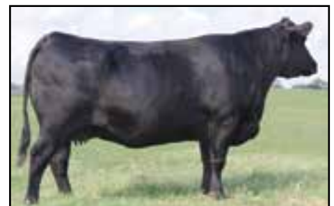
Breesha of Conanga 1251 Granddam of W148