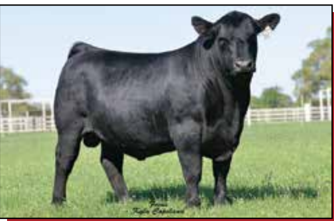
MGR Treasure Reference Sire