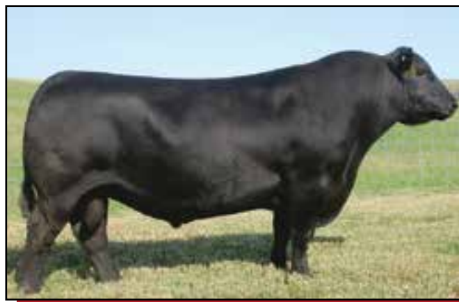
S A V Sensation 5615 Reference Sire