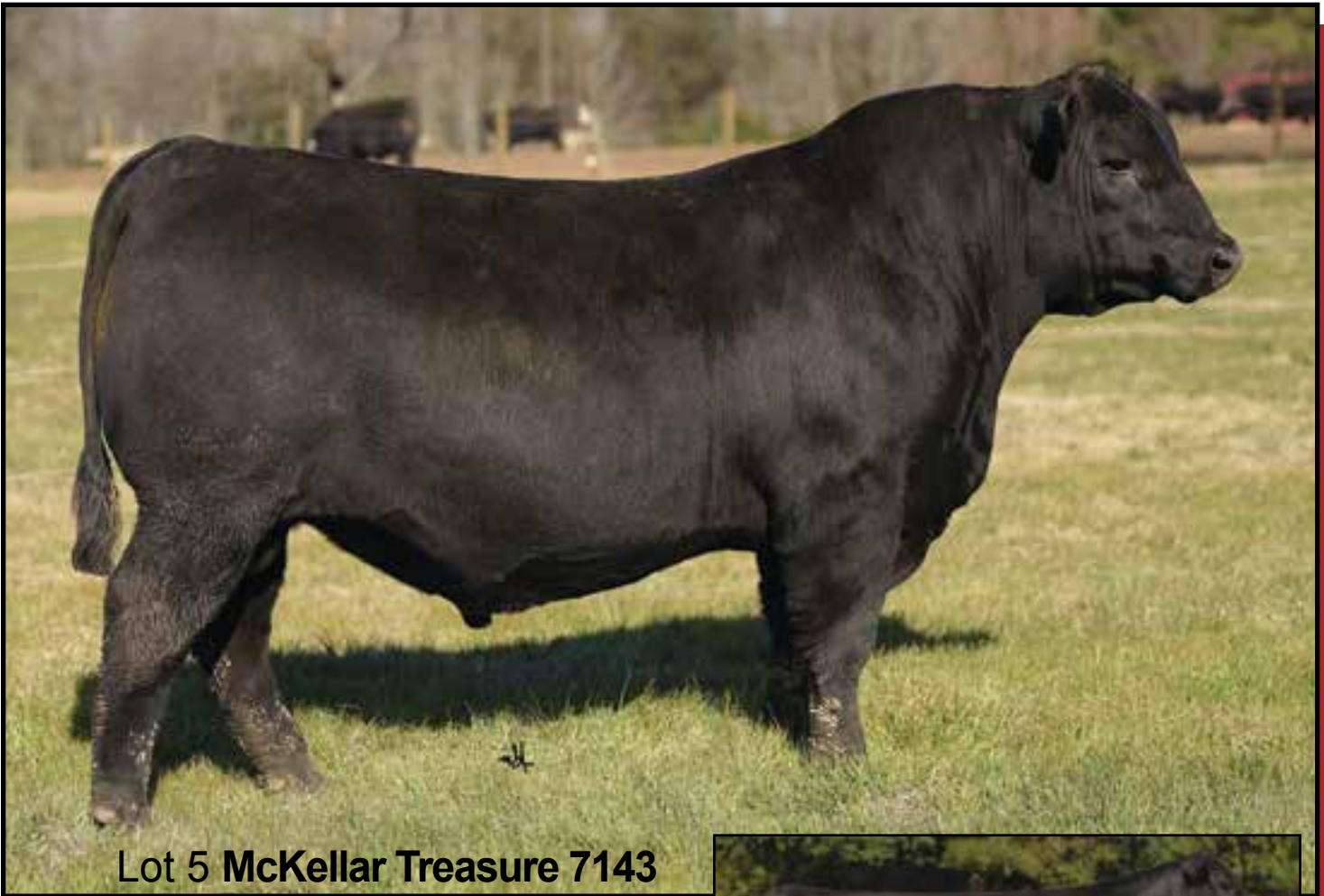
Lot 5 McKellar Treasure 7143