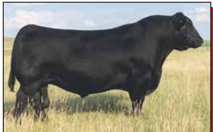
SAV Renown Reference Sire