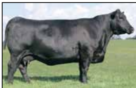
Executa of Conanga 939 Pathfinder Dam of Connealy Mentor