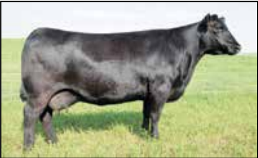
S A V Blackcap May 4136 Paternal Granddam of Lot 108

Sells bred to: Jindra Acclaim Exp. Calving Date: 9/20/2019 Lot 108 is a rare gem. She is a powerfully made maternal sister to the original Connealy Consensus sired by Genex/CRI sire SAV Renown. Lot 108 is a model Angus female with front pasture phenotype and worlds of potential.