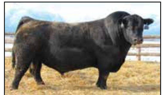
Coleman Charlo 0256 Sire of Lot 11