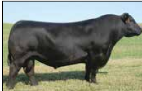
S A V Sensation 10 sons & 3 daughters sell