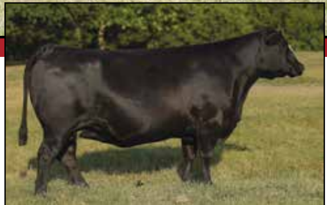
JMc Beretta 1334 W148 Dam of Lot 2