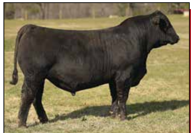
Lot 21 McKellar Treasure 7224