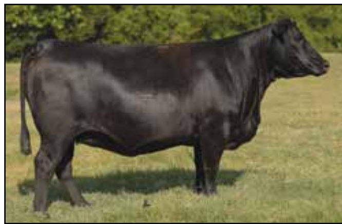
McKellar Blindea Claire 4096 Reference Donor