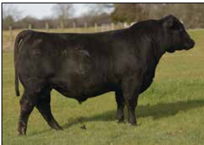
Lot 15 McKellar Renown 7231