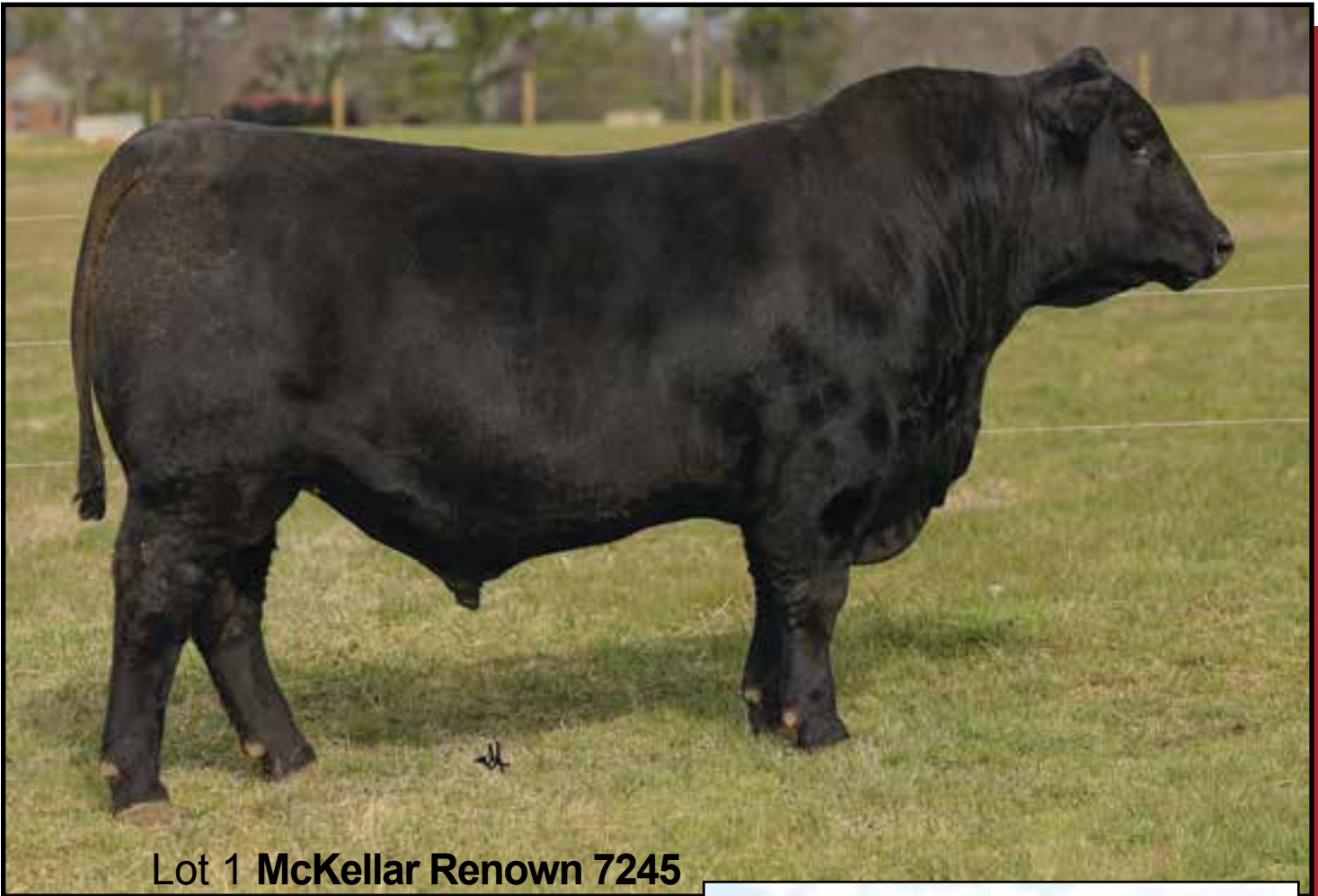
Lot 1 McKellar Renown 7245