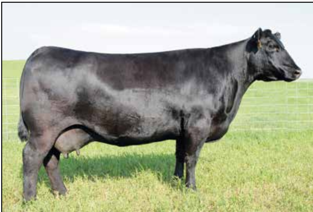
S A V Blackcap May 4136

No female in the history of the Angus breed has had a greater impact than SAV Blackcap May 4136. She is the breed's most influential genetic contributor. Schaff Angus Valley has sold 191 direct progeny of this female, making her the top income producing cow in the breed at $9.5 million. Her sons SAV Resource and SAV Renown were ranked 2nd and 10th in the Angus breed or registrations last year, the only time 2 full brothers had ever made the Top 10. Her influence has accelerated the quality of our cattle in a very short time period. 79 bulls and 19 females in this offering feature this matriarch as their paternal grand dam.