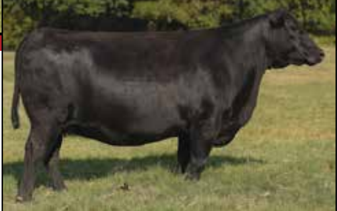
JMc Blindetta 1409 672 Dam of Lot 5