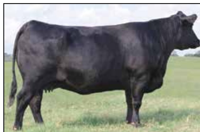
Breesha of Conanga 1251 Reference Donor