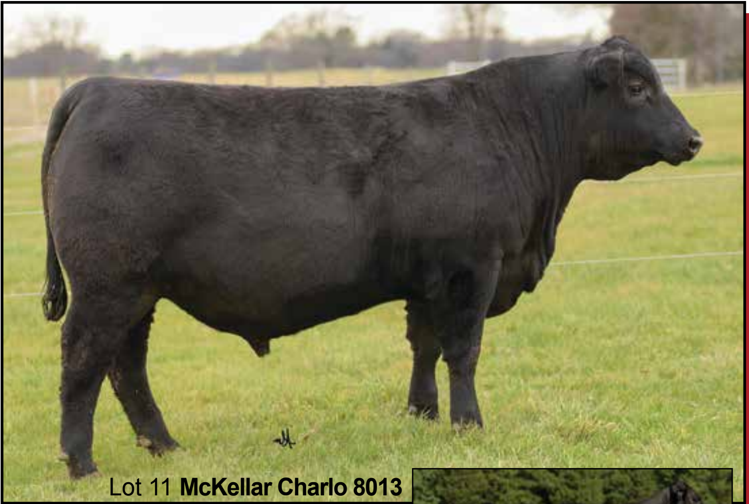
Lot 11 McKellar Charlo 8013