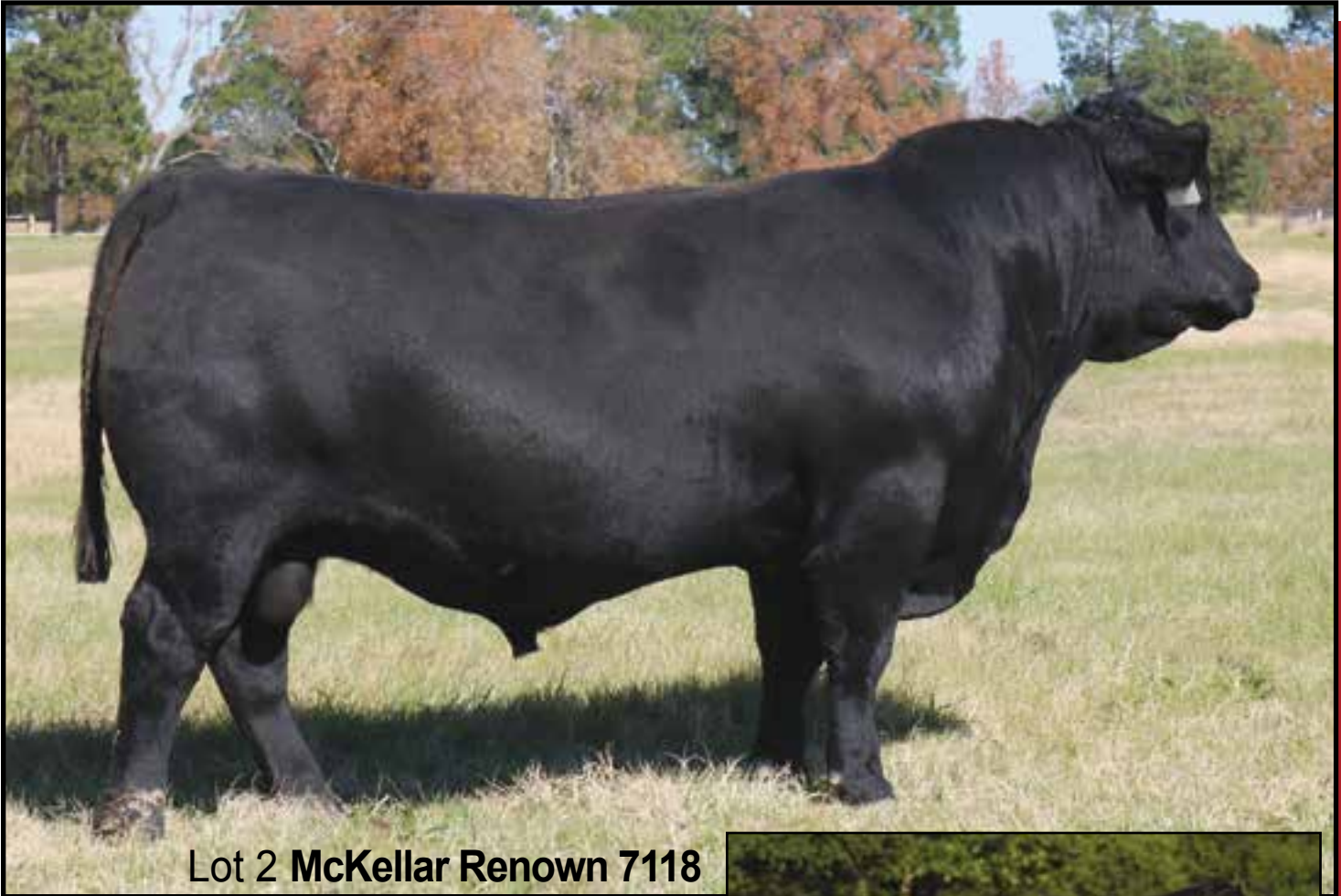
Lot 2 McKellar Renown 7118