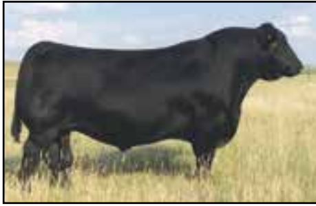
S A V Renown 43 sons & 15 daughters sell