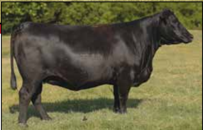
McKellar Blindea Claire 4096 Dam of Lot 3