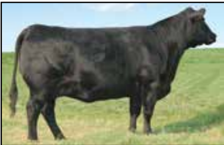
Blinda of Conanga 004 Dam of the original Connealy Consensus