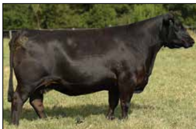
K C F Miss Protege W148 Reference Donor