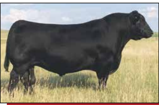
SAV Renown Reference Sire