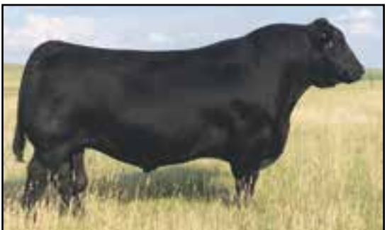
S A V Renown 3439 Sire of Lot 7

His dam, KCF Miss Protégé W148, is a very sought after female in our program. She is the dam of Alta Beef sire, KCF Bennett The Rock A473 and herd sires KCF Bennett Consent Y75, McKellar High Roller, McKellar Braveheart and McKellar Cortez. She is also the dam of our most prolific donor, JMc Beretta 1334, who is featured in this offering. Lots 7 & 9 are flushmates.