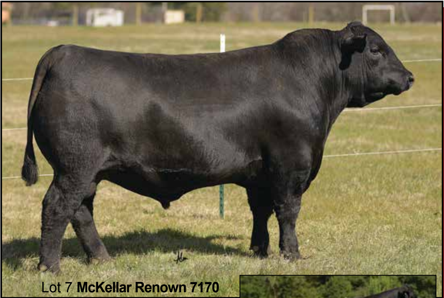
Lot 7 McKellar Renown 7170