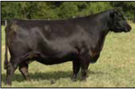
K C F Miss Protege W148 Dam of KCF Bennett The Rock A473