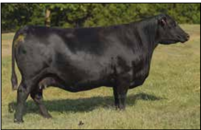
Britta of Conanga 157E Reference Donor