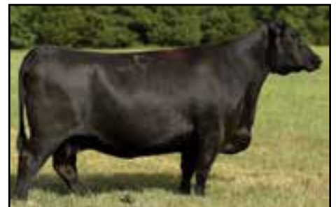
Jais of Conanga 9585 Dam of Connealy Front & Center