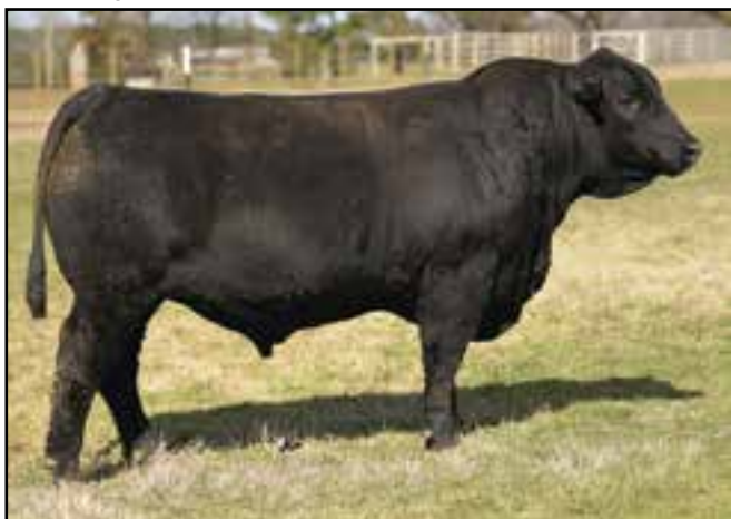
Lot 33 McKellar Renown 7186