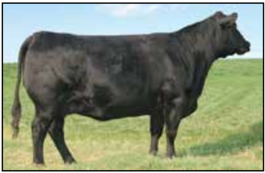
JMc Blindetta 1409 672 Maternal Granddam of Lot 5

Lot 5, a son of ST Genetics sire MGR Treasure, has been very popular by all who have been through his pen. He has commanding herd bull looks with an attractive stride and solid muscling. He hit the mark at every stage of production solidifying himself as an elite bull in this offering. His dam, JMc Blindetta 1409 672, is a full sister to the original Connealy Consensus. She is wide hipped, giant ribbed and long spined. A prolific embryo producer, she has consistently produced bulls in high demand for their low birth weights, growth and solid quality. Lots 5, 65, 66 & 69 are flushmates.