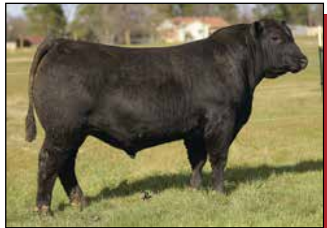
Lot 19 McKellar Renown 7226