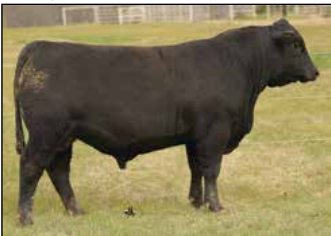
Lot 26 McKellar Resource 8074