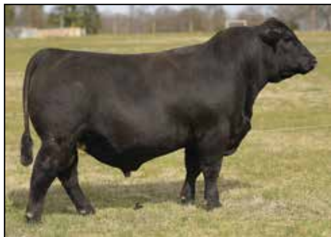
Lot 18 McKellar Renown 7209