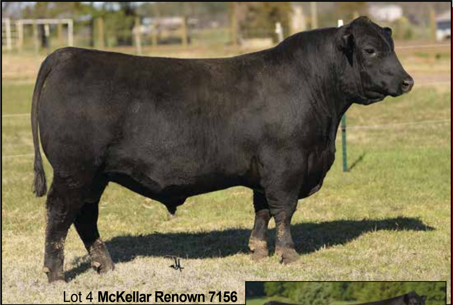
Lot 4 McKellar Renown 7156