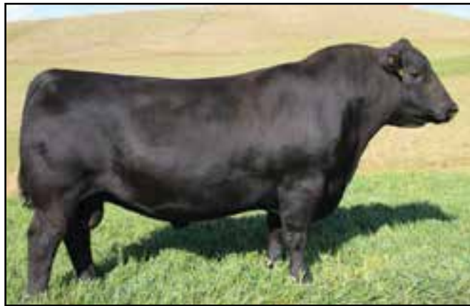
S A V Seedstock 4838 Reference Sire