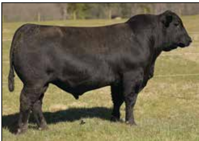
Lot 37 McKellar Renown 7177