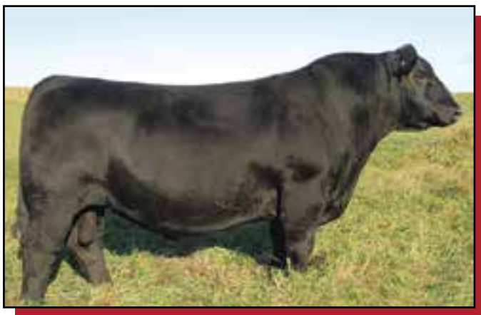
S A V Universal 4038 Reference Sire