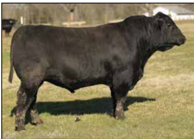
Lot 30 McKellar Renown 7138