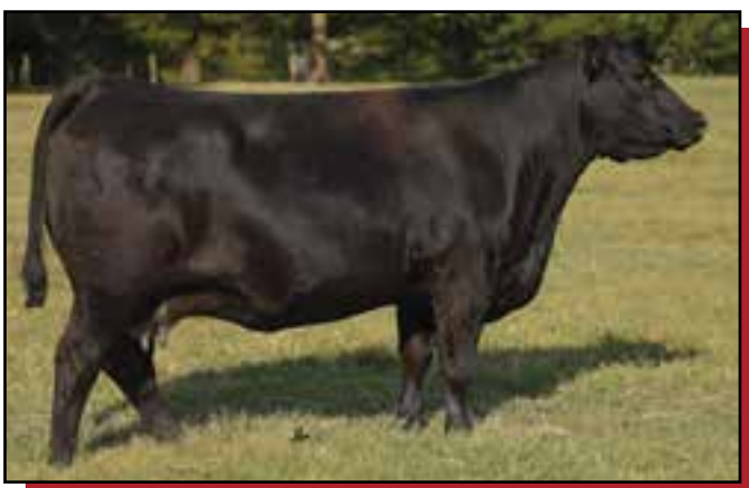
McKellar Enlass Bree 3388 Reference Donor