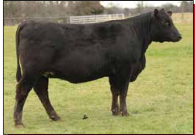
Lot 111 McKellar Beretta May 7150