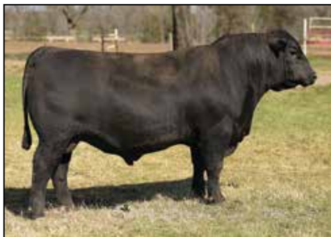
Lot 10 McKellar Y75 7163