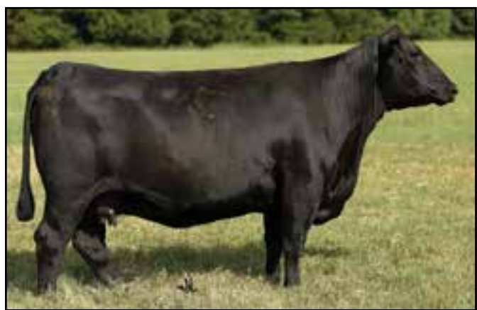
Boka Bay of Conanga 13X Reference Donor