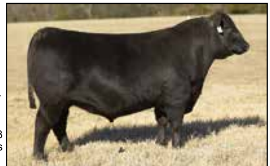
McKellar Recon Full Brother to Lot 2