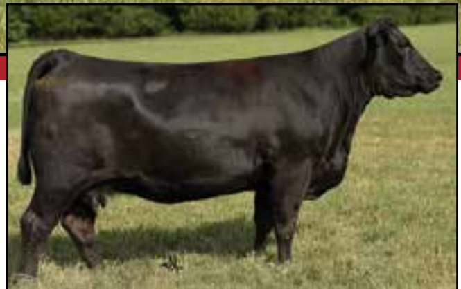
McKellar Enlass Bree 3388