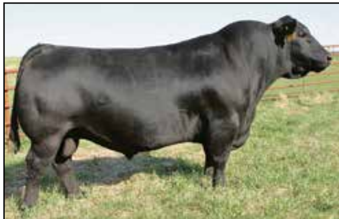
S A V Resource 1441 Reference Sire