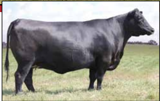
Joy Erin of Conanga 8352 Dam of Lot 1