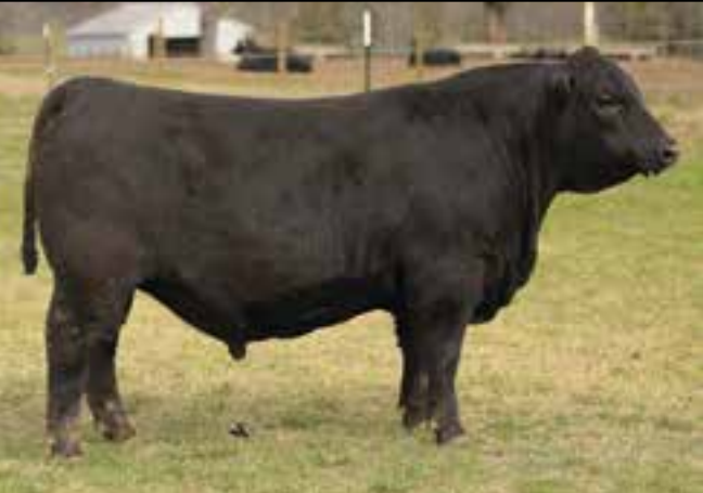
Lot 23 McKellar Charlo 8021