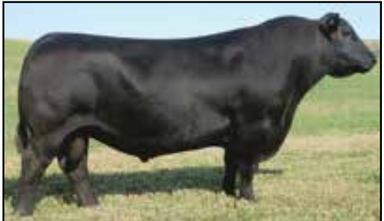
S A V Sensation 5615 Sire of Lot 3

Lot 3, a son of Herbster Angus sire, SAV Sensation, has been the pick of many astute cattlemen for his tremendous rib shape, capacity and base width. This bull is an absolute tank carrying meat deep into his flank and quarter. Lot 3 scanned one of the high rib eyes at 17.3. His dam, McKellar Blindea Claire 4096, is an exciting up and coming donor in our program. Her progeny are growthy and attractive and hit all the marks. Her sons are masculine and daughters are very feminine. 4096 has earned an impressive progeny ultrasound carcass ratio of 14 head at 104 for Scan %IMF, and 14 head at 101 for ribeye. Her dam is a maternal sister to the original Connealy Consensus. Lots 3, 29, 31, 32 are flushmates.