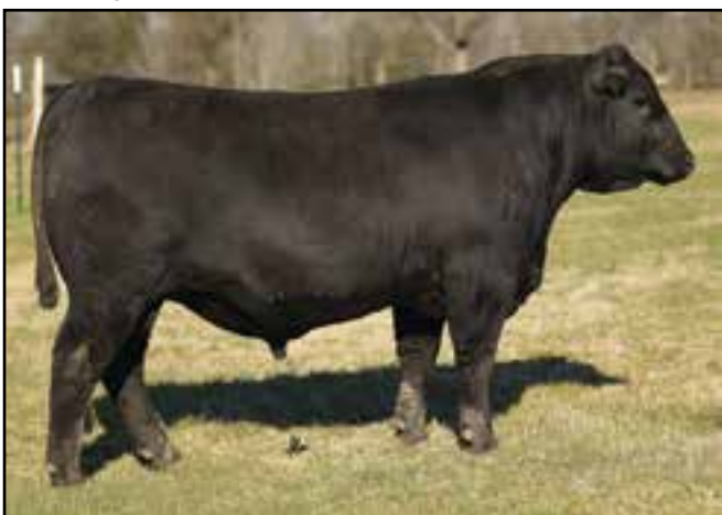
Lot 67 McKellar Y75 7103