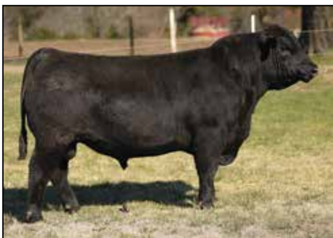
Lot 8 McKellar Trespure 7095