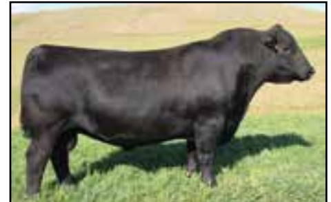
S A V Seedstock 1 son sells