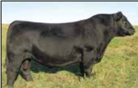
S A V Universal 15 sons & 1 daughter sell