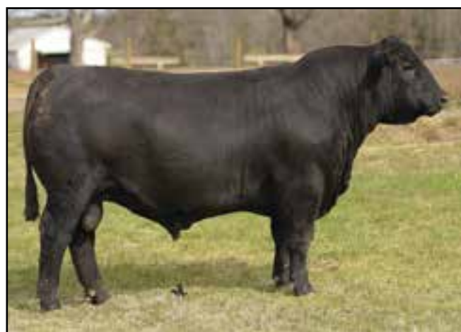
Lot 70 McKellar Renown 7153