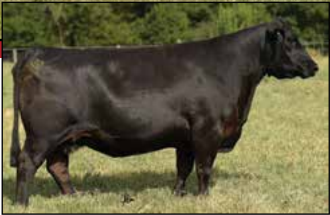
K C F Miss Protege W148 Dam of Lot 7