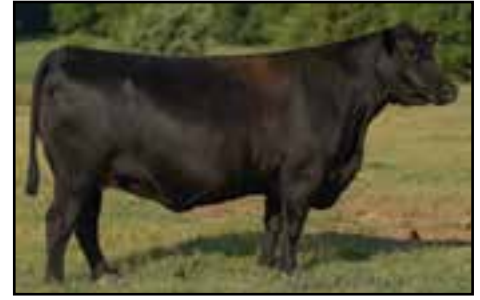
McKellar Breeana 4095 Daughter of 1334