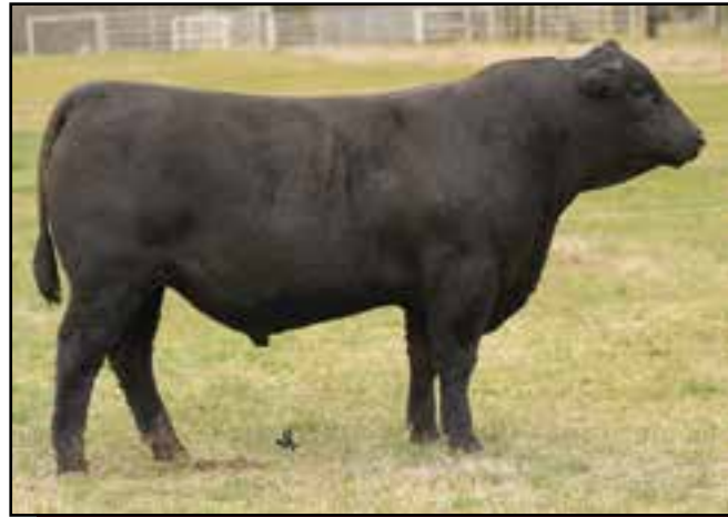
Lot 25 McKellar Renown 8071