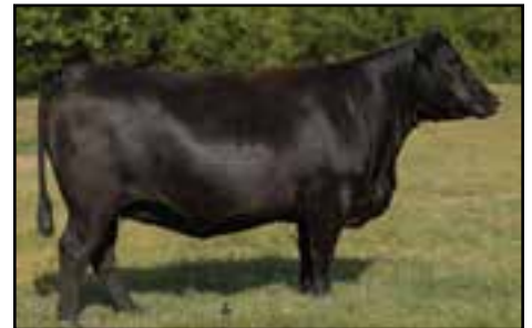
McKellar Blindea Claire 4096 Daughter of 1383