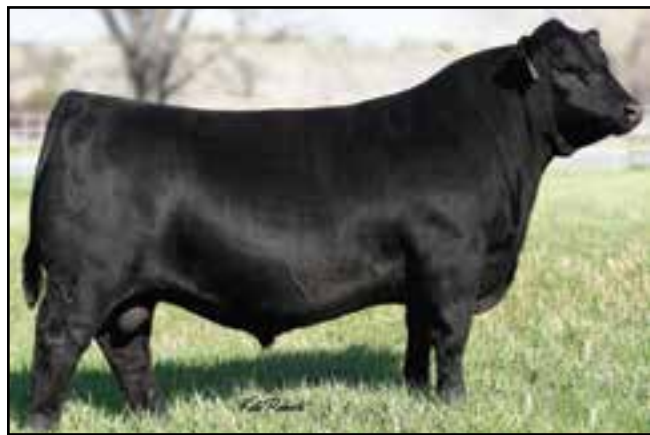
SAV Raindance 6848 Reference Sire