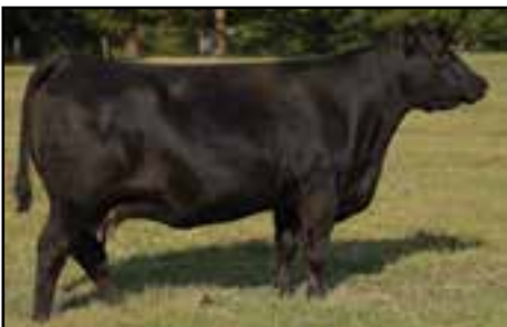
McKellar Enlass Bree 3388 Program leading marbling and production