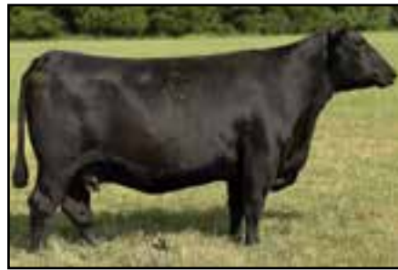
Boka Bay of Conanga 13X Dam of Connealy Conquest