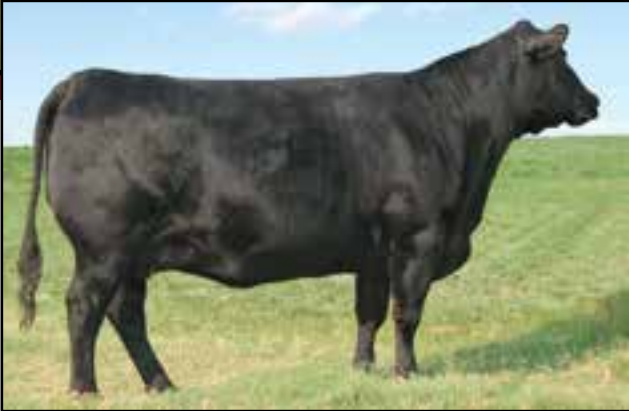
Blinda of Conanga 004 Dam of Lot 108