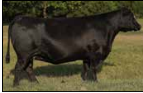
JMc Beretta 1334 W148 Daughter of W148 by the original Connealy Consensus