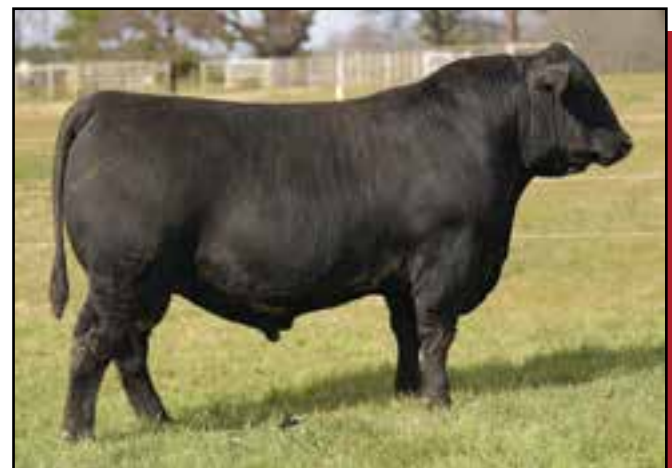
Lot 20 McKellar Renown 7240