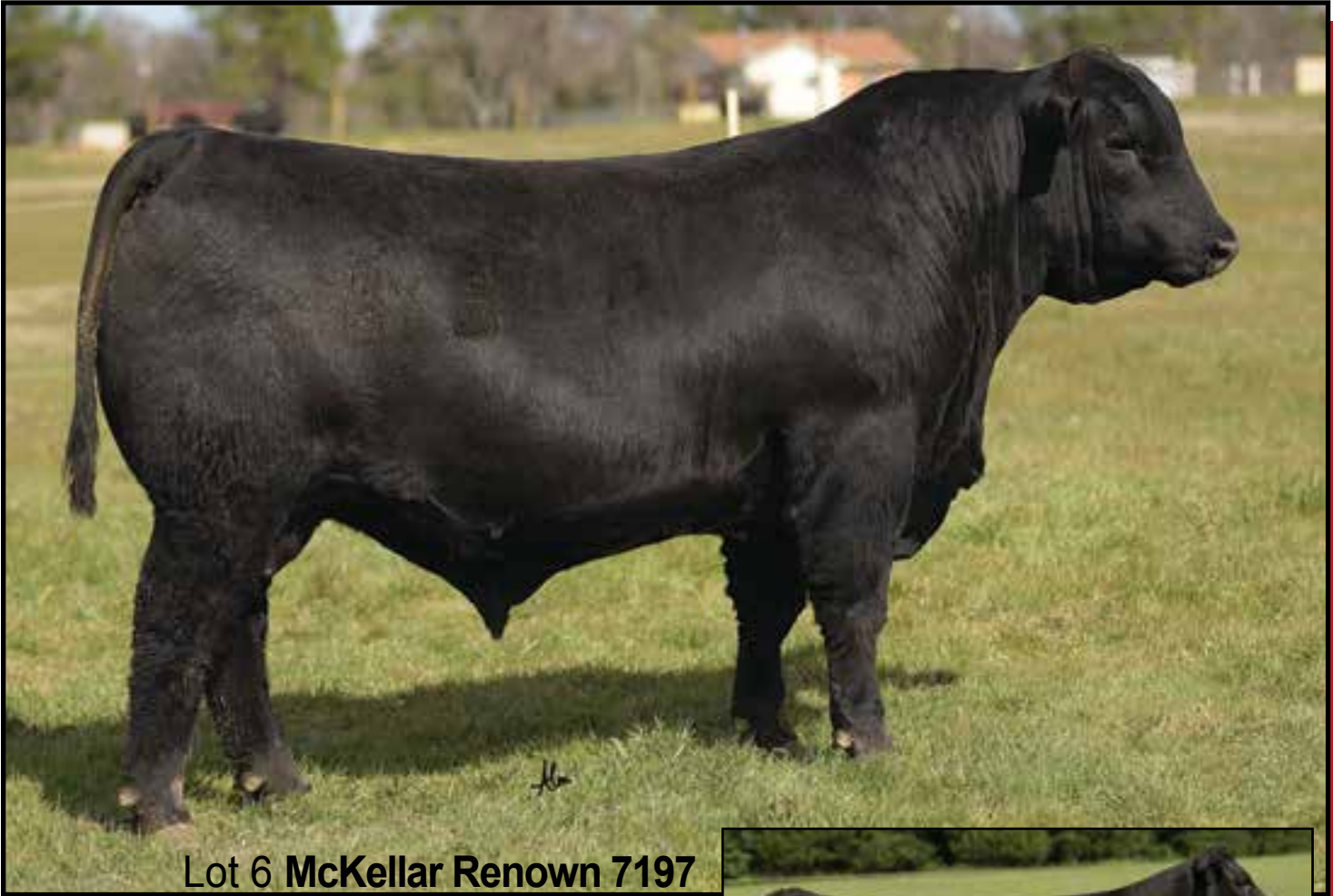
Lot 6 McKellar Renown 7197