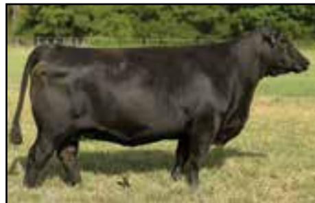
McKellar Blindea 1383 672 Maternal sister to the original Connealy Consensus