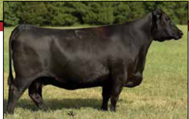
Jais of Conanga 9585 Dam of Lot 11