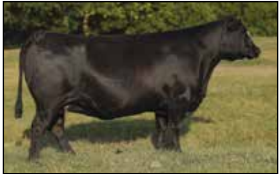
JMc Beretta 1334 W148 Maternal Granddam of Lot 4

Lot 4, a son of Genex/CRI sire SAV Renown, has shown promise from day one. His commanding presence was evident very early on. He is powerfully made with abundant muscling and carries meat deep into his flank. He hits all the marks of a high octane performance bull, while having a controlled birth weight. His projections match his stellar individual performance figures.