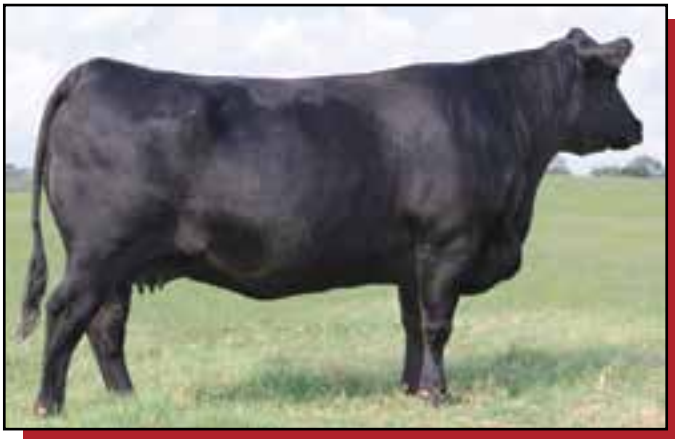
Breasha of Conanga 1251 Reference Donor