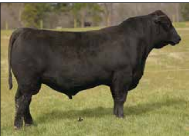
Lot 42 McKellar Renown 7213