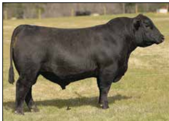
Lot 36 McKellar Renown 7126